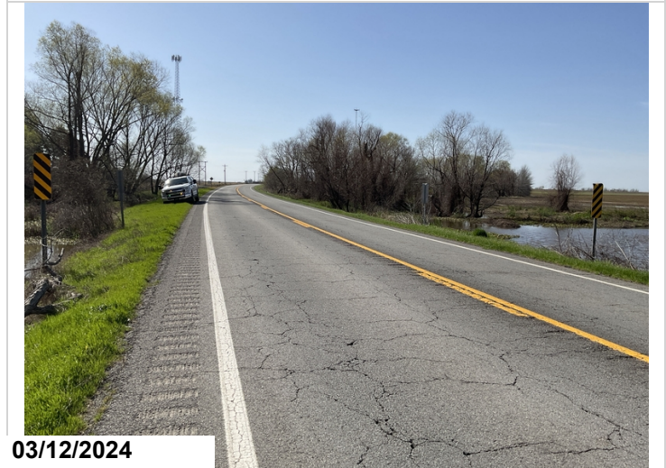
Approach looking south